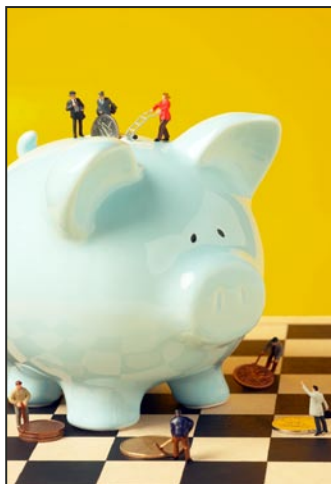
The Cash Management module helps you manage your money.

It's easy to forget to enter bank fees and then be unable to reconcile at month end. With the Cash Management module, you can use the Enter Bank Transactions option to add information about bank deposits, charges, credits, withdrawals, and transfers that weren't entered in Accounts Receivable.