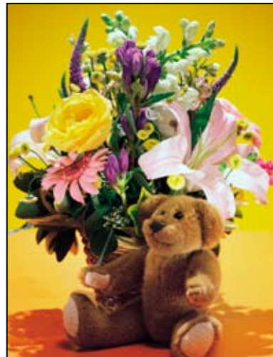
Companies that assemble several items into a package for resale also can benefit from the Bill of Materials module.

What happens when one of ABC's customers wants a green basket instead of blue, or a stuffed dog instead of a bear? That's where the Bill of Materials module's Options come in. By setting up various options for its bills, ABC can accommodate variations in the basic bill without setting up multiple bills to represent minor changes. During Sales Order Entry, ABC's staff can enter a bill and then configure that bill by selecting the options established for the bill. The result is a clean, intuitive interface for ABC's staff, and an efficient, effective inventory and order entry system for the company.