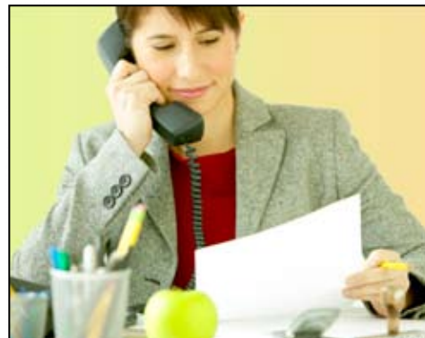
A purchase order system can streamline and organize your entire purchasing process.

Every company buys products and services, even if they do not resell those products or use them in a manufacturing process. You purchase office supplies, computer hardware and software, office furniture, magazine subscriptions, and a host of other products. You also purchase services such as tax preparation, legal consulting, and temporary employment. All of these items can be handled more efficiently by using purchase orders. Let's look at the benefits offered by a purchase order system, and then some specific efficiencies and control the Sage MAS 90 ERP Purchase Order module can offer your company.